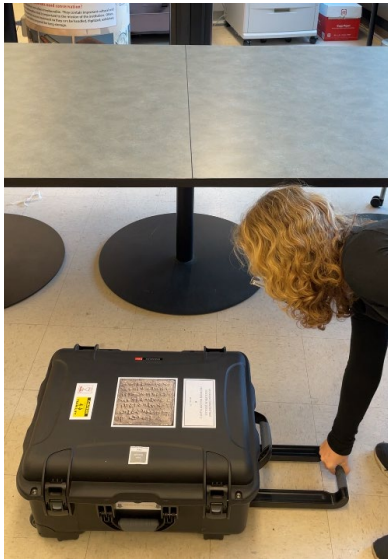
1. Lay case flat on a low surface, near surface for viewing.

For the safety of the handler and the tablet, this object needs to be lifted by two people.