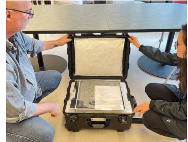
3. Remove photographic documentation and foam.