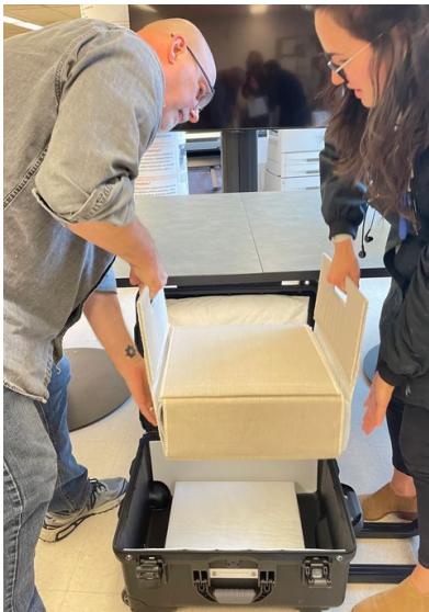
4. Lift tablet and support bottom of wrapper