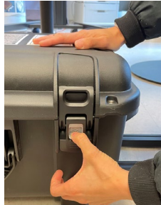
2. Open lid.