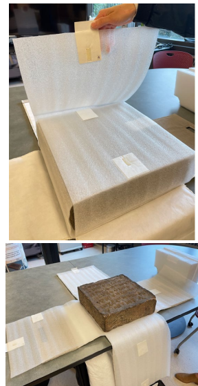
5. Open foam flaps. Lift Tyvek tabs to unlatch Velcro fastenings.

Use gloves if handling the cuneiform tablet. It's recommended to view the tablet in the wrapper, however, if the tablet is to go on long-term display within a case, the Tyvek covered foam support in the bottom of the case can be used as an exhibition support.